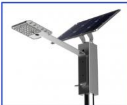
Solar Street Light