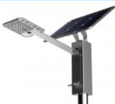
Solar Street Light