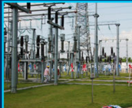
Power Station energy storage