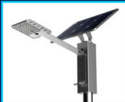
Solar Street Ligh