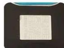
Complete QR Code