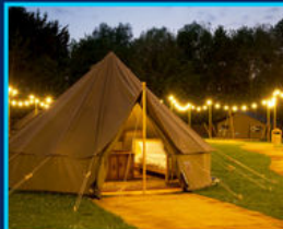
Household energy storage