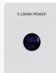
Solar LiFePO4 B5.12KW 51.2V 100Ah 200Ah attery